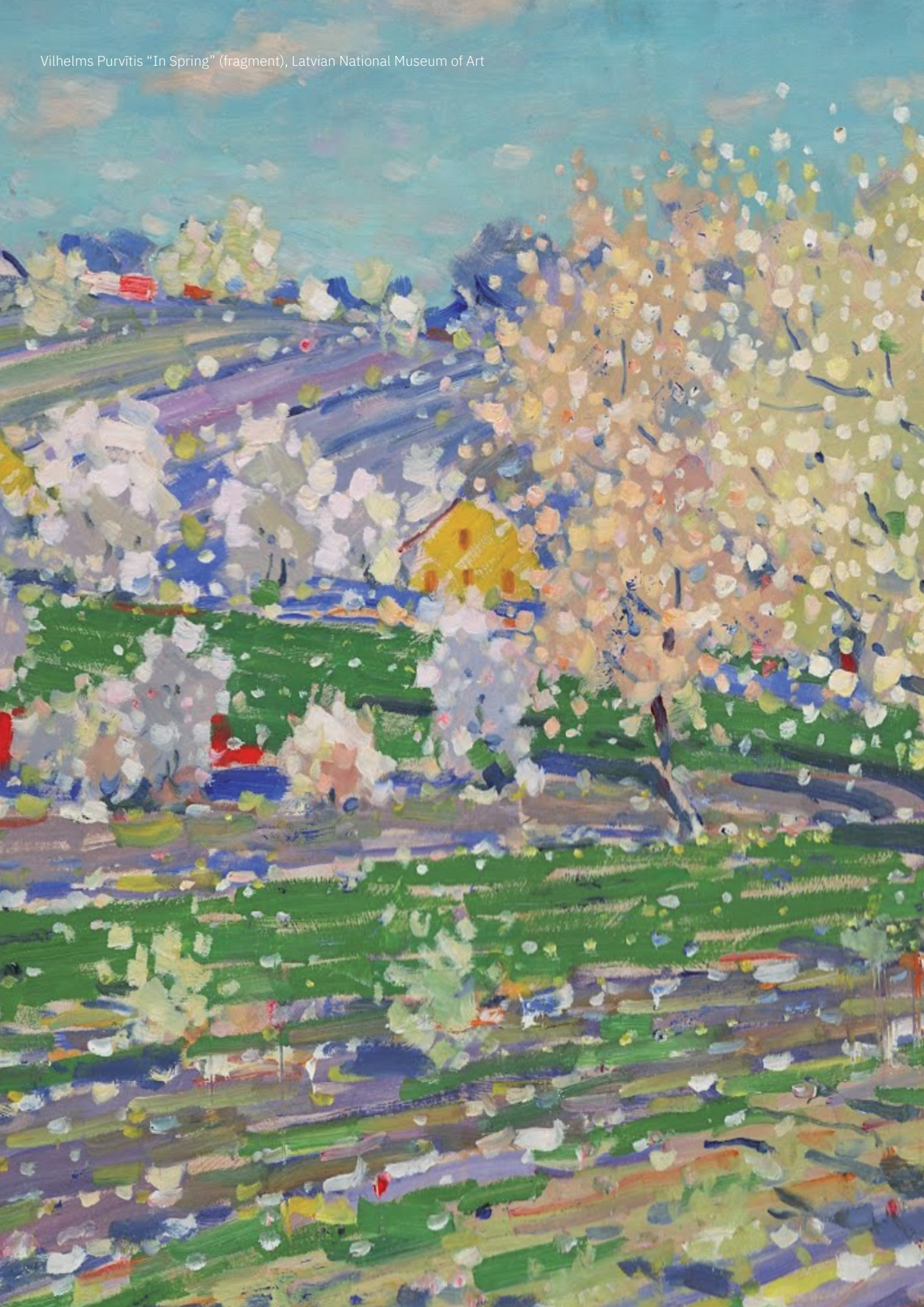
Vilhelms Purvītis "In Spring" (fragment), Latvian National Museum of Art